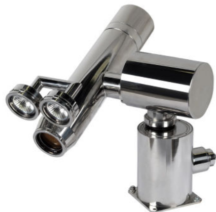
Figure 1: Standard Diakont Rad-Hardened D70 CCTV Camera

Nuclear remote monitoring applications are never straightforward – an off-the-shelf network switching system simply does not provide the level of performance required in the extreme environment of a reactor. Let Diakont use our years of operating experience to guide you to a video system that works for you. We offer a wide array of customization choices to ensure that you get the best value for your investment befitting the specific needs of your operation.